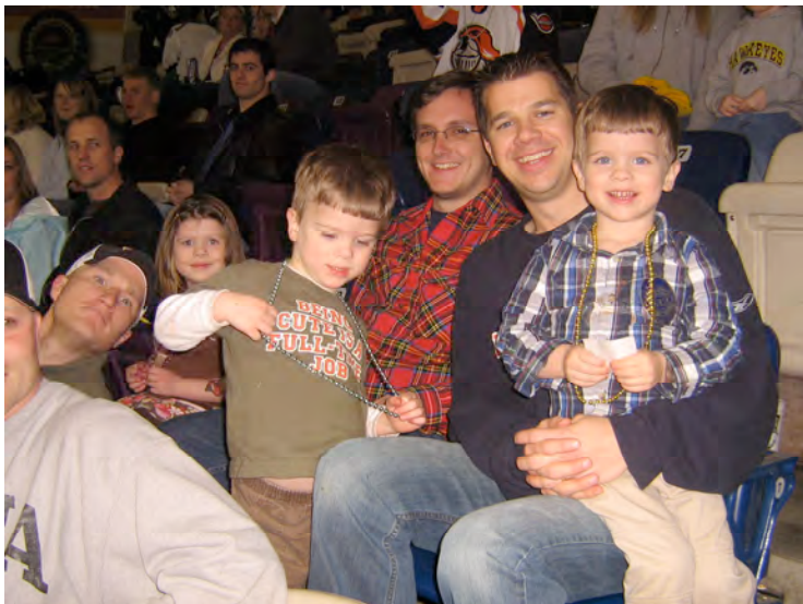
Eastern Iowa YMG at Roughriders Hockey Game

We also continue to host a 9-week PE Review Course for local engineers preparing for the PE exam. Our next course will be starting in early February 2009. Each evening that the group meets, ASCE PE Review CD's on each of these seven subjects will be shown: economics, structures, transportation, geotechnical engineering, hydraulics and hydrology, sanitary and environmental engineering, and construction. For each subject, we find volunteer local experts to help answer any questions that come up and to supplement the material presented on the CD's. This has been a huge success and we have received excellent feedback from those who took the course in previous years. We plan to continue this service as long as there is demand.